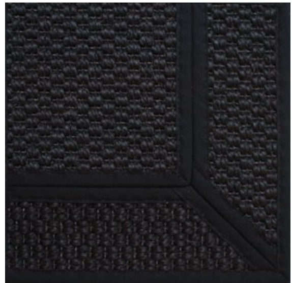
Sisal by Sisal Area rug option.