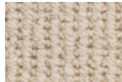
□4983 Raw Cotton