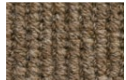
□4815 Willow Grove