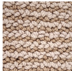
□2584 Dusty Mesa