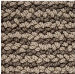
□2583 Mountain Gate