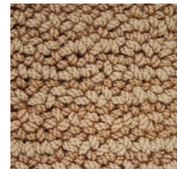
□2581 Bleached Coral