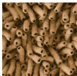
□9602 Deer Path