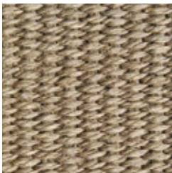
□ 1850 Dark Taupe