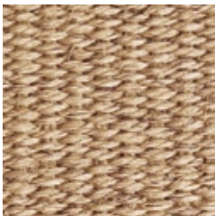
□ 1820 Brass