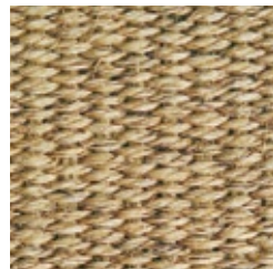
□ 1840 Old Copper