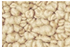
□5751 Irish Linen