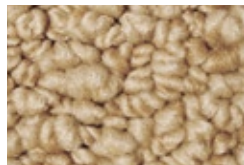
□5755 Raw Silk