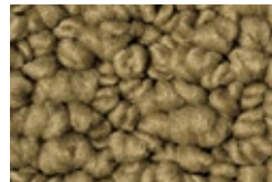
□5760 Pine Needle