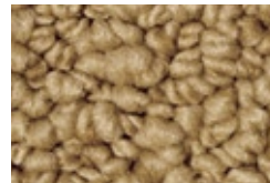
□5761 Indian Elephant