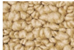
□5752 River Sand