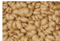
□5757 California Oak