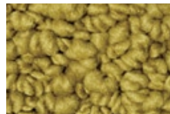
□5764 Laurel Flower