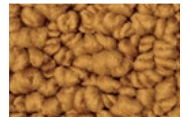
□5766 Cinnamon Twist

Available in Custom Area Rugs - Custom Colors Available