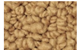
□5754 Golden Raisin