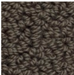
□2169 Royal Oak