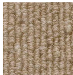
2143 Olive Grove