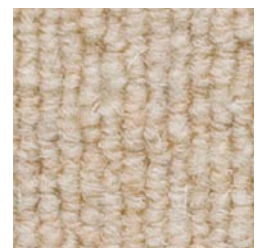
2392 Playa De Oro