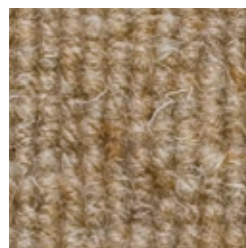
□1591 Weathered Oak