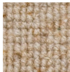
□1593 Lake Shore