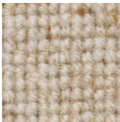
□1597 Summer Breeze

Available in Custom Area Rugs - Custom Colors Available