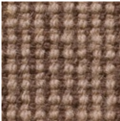
□2140 Spanish Oak