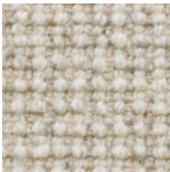
□2114 Barbary Coast