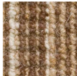
□ 1503 Gramercy Park