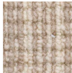
□ 1504 Skyline