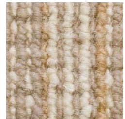
□ 1505 Stonecrest

Available in Custom Area Rugs - Custom Colors Available