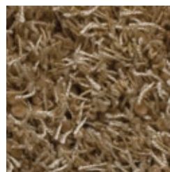
□9653 Shimmering Sand