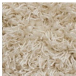
□9651 Snow Goose