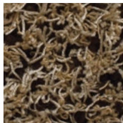
□9657 Truffle Cream

Available in Custom Area Rugs - Custom Colors Available