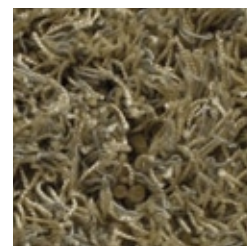
□9654 Mint Julep