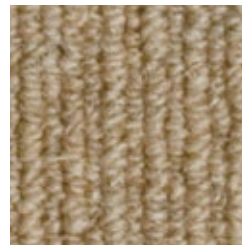
□2118 Vista De Oro