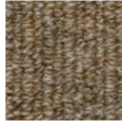
□2140 Walnut Grove