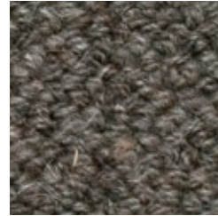
□2179 Canyon Shadows