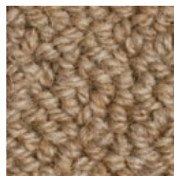
□2124 Rustic Pine