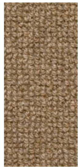
Cascade Naturals Coordinating Texture