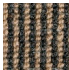
□ 1773 Walnut