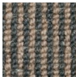
□ 1776 Sand Ridge