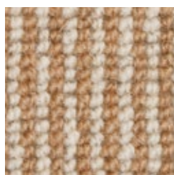
□ 1770 Bamboo