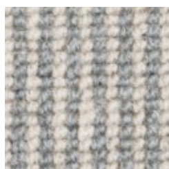
□ 1771 Silver Birch