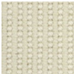
□5501 Costa Blanca